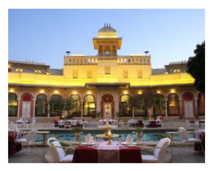
The Pool Deck, Shiv Niwas Palace: An intimate setting

At The Pool Deck in Shiv Niwas Palace you step into an elegant venue, with glittering lights on the flowering trees and shimmering blue waters of the pool making for an unforgettable evening event. Cocktails, buffets, sit-down dinners for corporate and wedding celebrations are regularly held here for up to 300 guests. Special décor and flower arrangements enhance the elegance of The Pool Deck around which are located the Royal Suites of the Shiv Niwas Palace. In this exclusive palace courtyard, your event is as private as you want it to be, as enlivening and memorable as it can be.